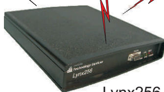
Lynx256 Wireless Receiver